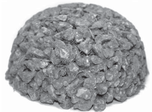
Figure 1. A "popcorn ball" textured sample of pervious concrete.

Potentially lower overall costs. In some applications, porous pavement systems may eliminate the need for and/or reduce the