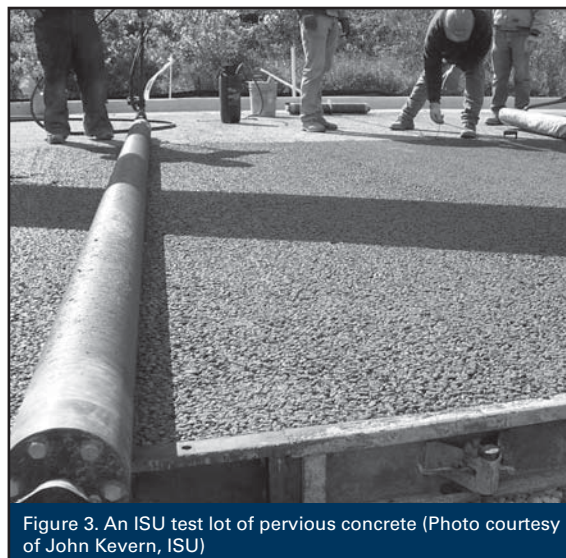
Figure 3. An ISU test lot of pervious concrete

Kevern helped design and keeps tabs on several Iowa test applications of pervious concrete systems, including handicap-accessible areas and sidewalks around a parking lot at Arnold's Park in Okoboji, and the new North Liberty Middle School parking lot. These relatively new projects are performing as expected.