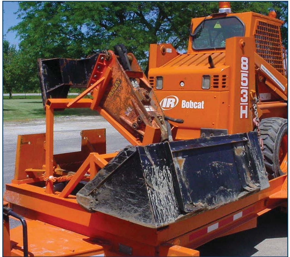
The attachment rack is attached to the same trailer that the skid loader rides.