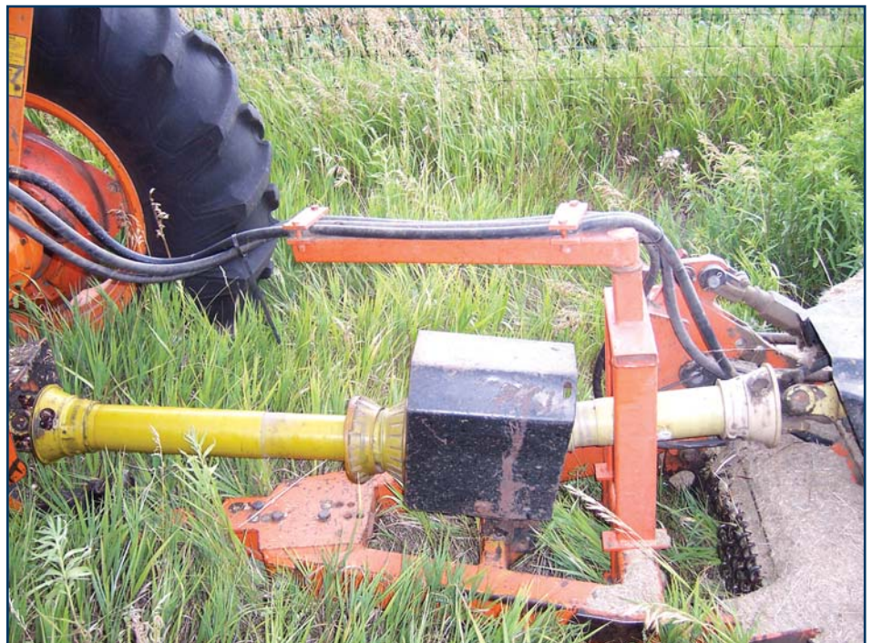
Extend the life of hydraulic hoses with the organizer.