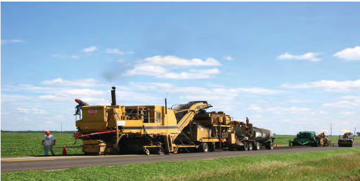
Photograph of a typical CIR recycling train