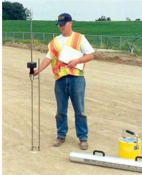
Operation of the dynamic cone penetrometer