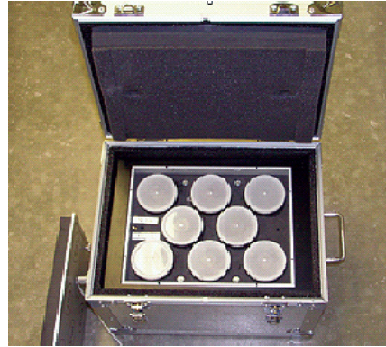
Device for measuring heat evolution data, to be developed in the next phase

In the next phase of this project (2006-2007), a standardized test device and procedure will be developed, field tested, and demonstrated using the CP Tech Center's Mobile Concrete Research Lab. This focused and systematic study will bring together test equipment specification, procedure development, heat evolution curve characterization, and pavement performance prediction.