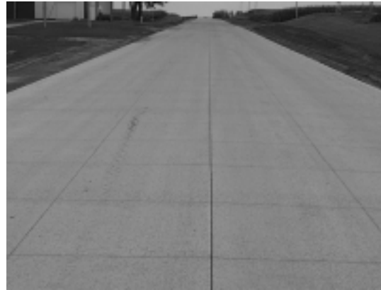
PCC overlay with longitudinal joints cut into the pavement