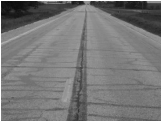
Asphalt pavement before PCC was laid

Overlay thickness. Part of the overlay is 3-1/2 inches thick; the rest is 4-1/2 inches thick.