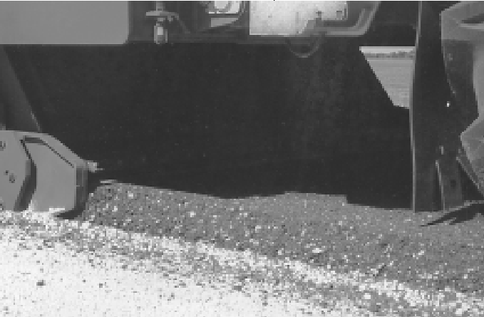
A close-up view of foamed asphalt application.

EVIDENCE of a renewed interest in foamed asphalt was seen at a fall 2000 workshop in Ames where a demonstration of the technology was attended by more than 100 paving professionals from Iowa and other states.