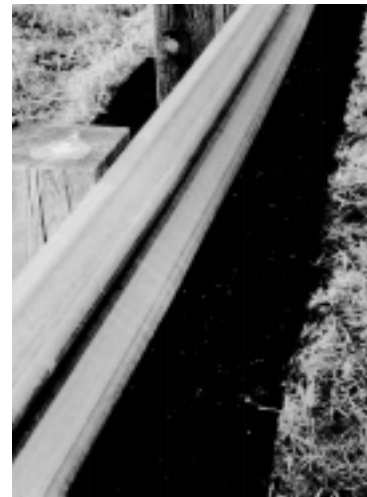
Recycled rubber matting removes workers from high-risk maintenance situations.

For more information, or to express your interest in participating, please contact Keith Knapp, CTRE, 515-294-7082, kknapp@iastate.edu , or Tom Welch, Iowa DOT, 515-239-1267, twelch@max.state.ia.us . •