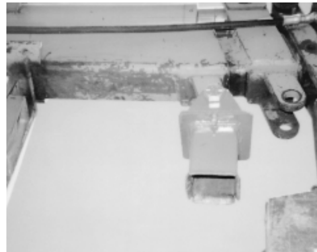
Ray Myers's hydraulic boom-mounted receiver for installing sign posts (perspective is from below the receiver).

For more information about the post receiver, contact Raymond Myers, 319-659-8230. •