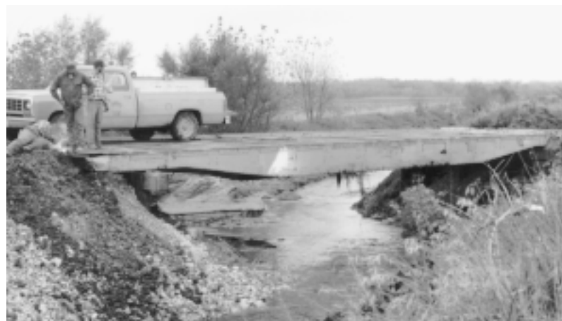
Construction of the Tama County RRFC bridge.