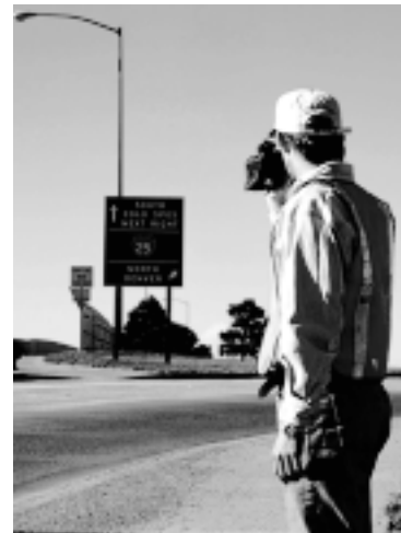
Retroreflectometers help agencies meet new standards for sign and pavement markings retroreflectivity.