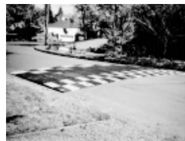
Portable speed humps may increase safety where excessive speed is a concern.