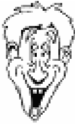
A. AUTHOR1 Organisation 1 Place 1