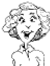
B. AUTHOR2 Organisation 2 Place 2