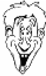
C. AUTHOR3 Organisation 3 Place 3