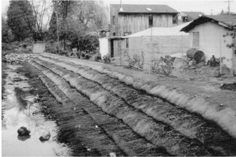
Figure 28. Completed geogrid installation