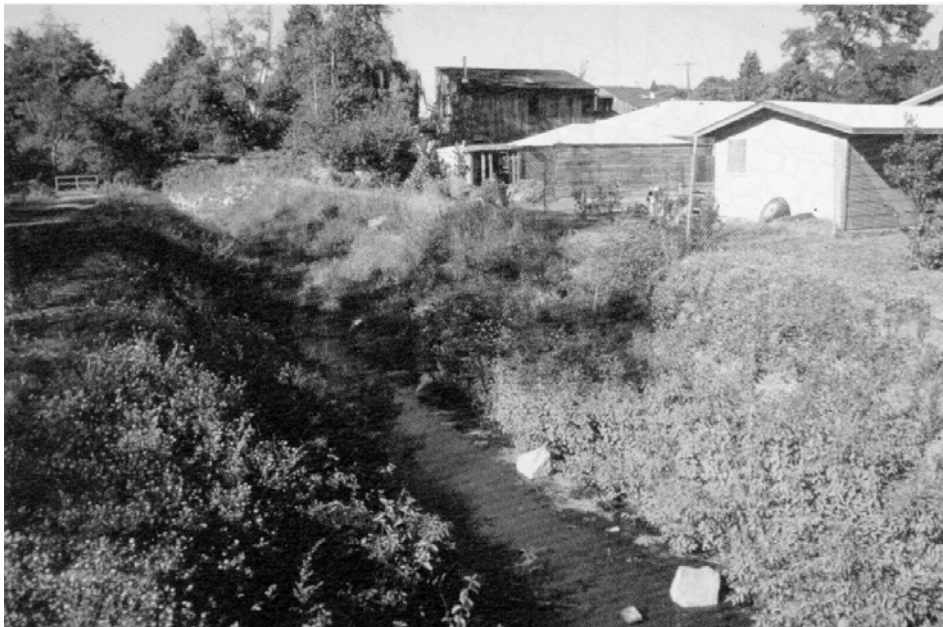
Figure 29. Vegetated geogrid two years after installation