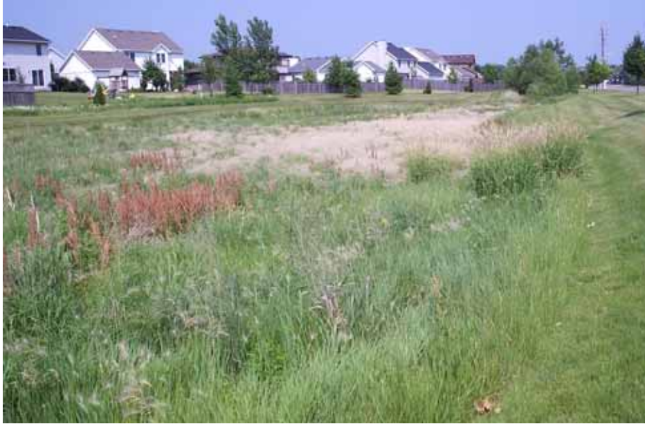
Figure 4.6. Urban wetlands