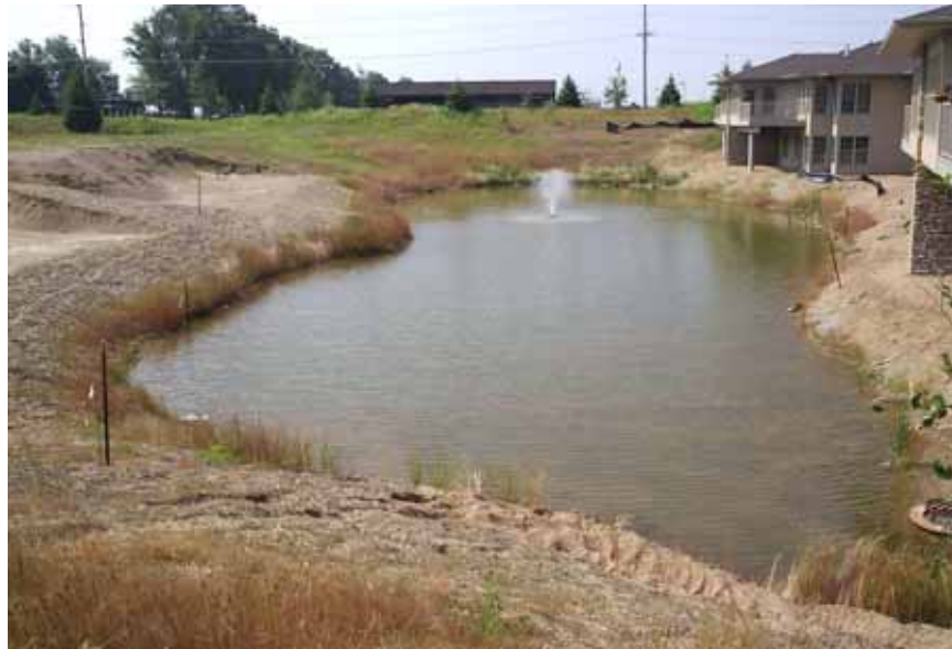
Figure 4.2. Retention pond