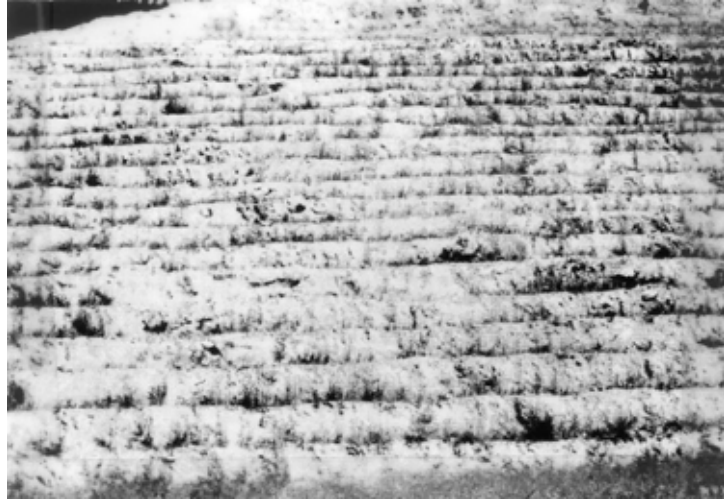
Figure 4.3. Serrated cut