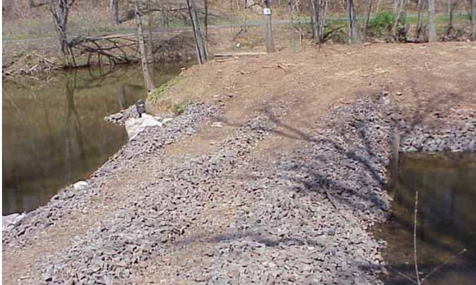
Figure 4.4. Temporary stream crossing