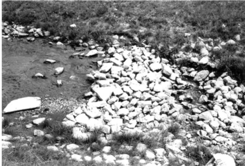
Figure 3.7. Check Dam