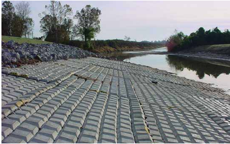
Figure 3.31. Streambank protection