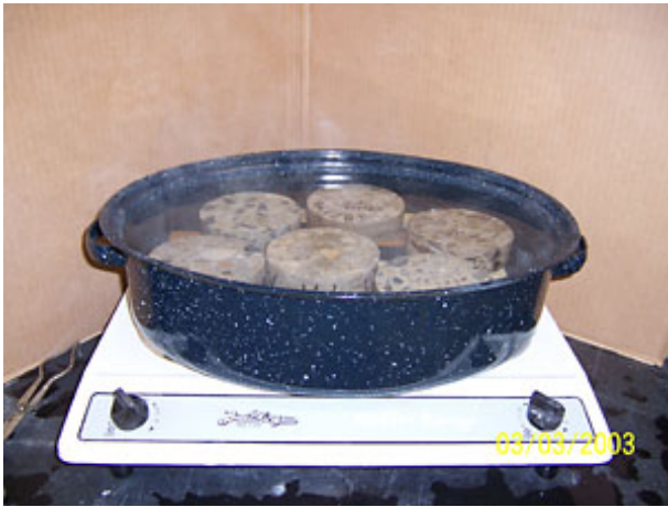
a boil test.