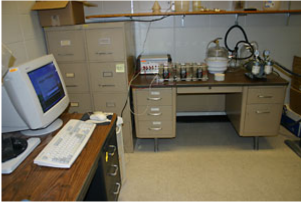
Equipment for the Rapid Chloride Permeability test.