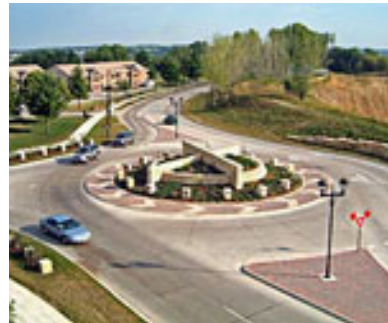
The First Avenue and Holiday Road roundabout in Coralville.

CTRE en route is published twice a year to inform readers about CTRE's projects and programs.