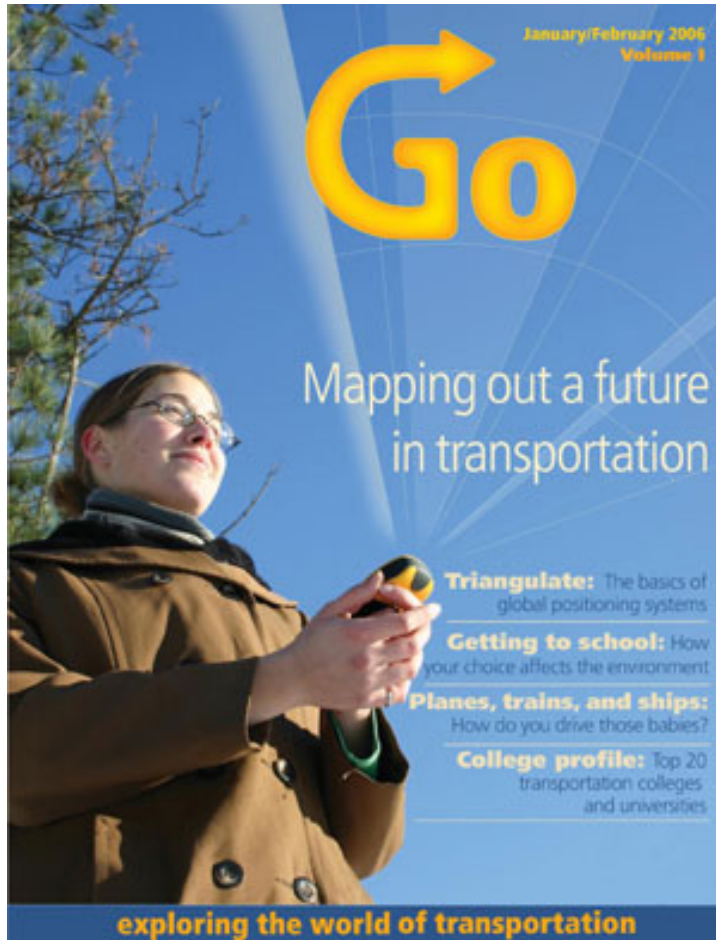
Sample magazine cover

CTRE proposes to publish a nonprofit, bimonthly magazine for teenagers about transportation.