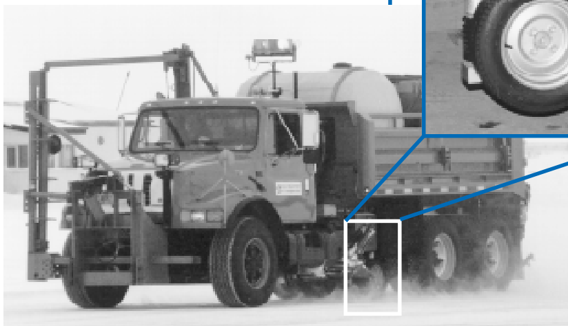
The SALTAR friction meter measures pavement surface friction in winter conditions.

Because of the promise shown by the SALTAR at North Bay, it has been installed on a new Iowa DOT maintenance vehicle for additional testing. Friction levels measured by the SALTAR on this vehicle will be reported to the Iowa DOT's district maintenance headquarters, where decisions about the application of deicing chemicals can be made. •