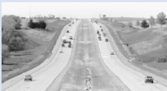
ISU's PCC Center will make its mark by helping shape the focus of PCC research.

To collect input about desirable characteristics of the next