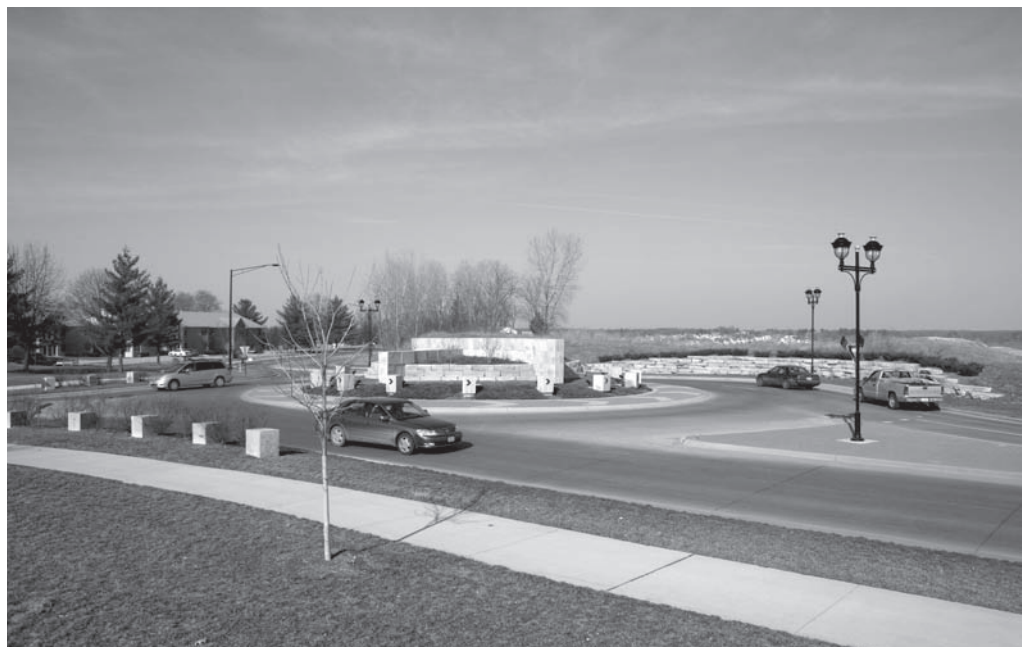
Three-leg roundabout in Coralville, Iowa.