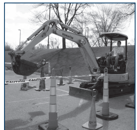
One of this year's most popular activity stations was the mini excavator, where students could experience firsthand what it's like to work with construction equipment.