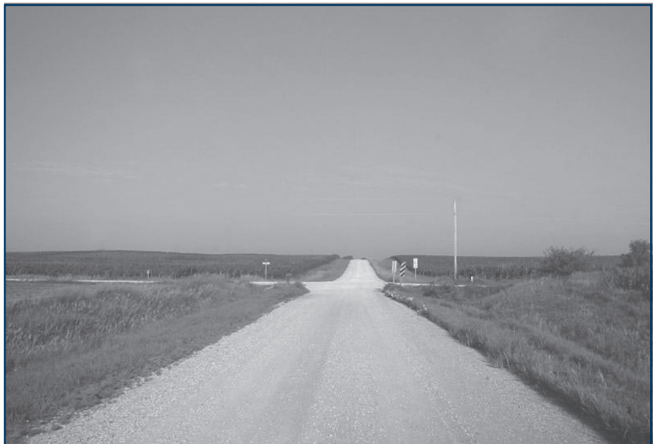
Ultra-low-volume unpaved rural intersections like this one may not need stop signs