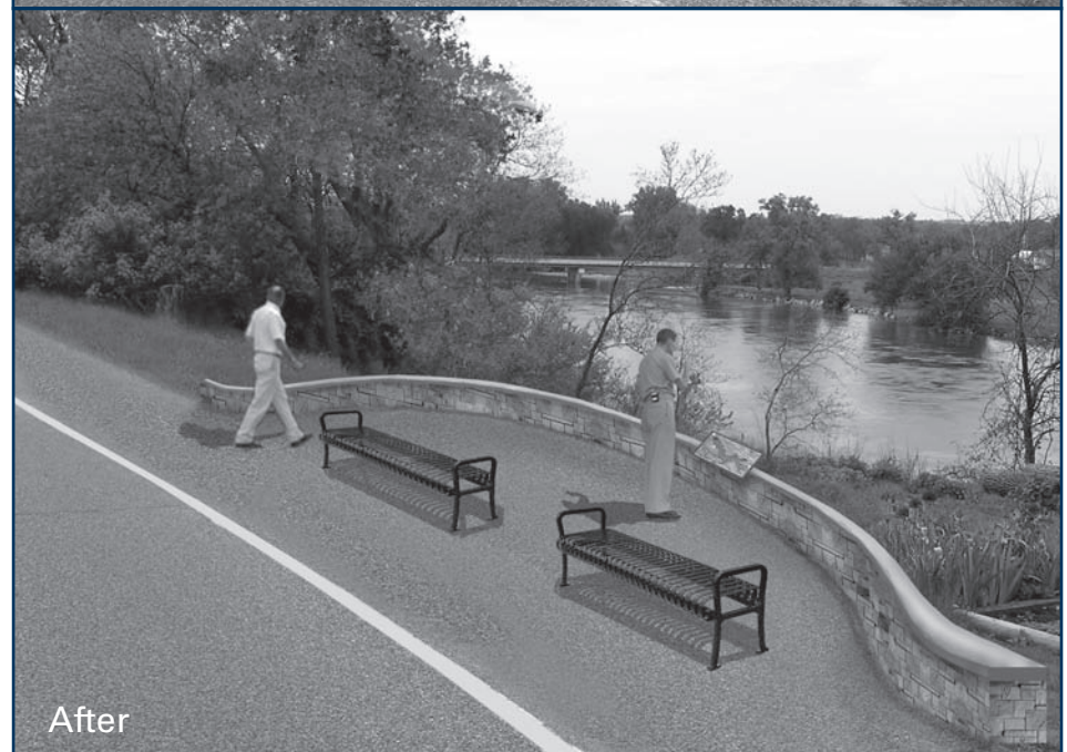
Gilbertville participated in the Living Roadways Community Visioning Program in 2005. The images depict the existing view of Cedar Creek and the same view with proposed enhancements in place.