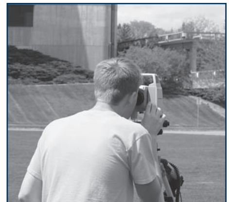
Students learned to use surveying equipment.

www.ctre.iastate.edu/events/careerfair/ ■