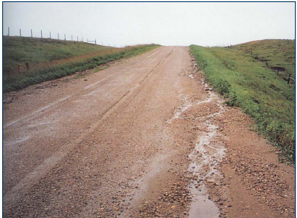
Figure 10. Secondary ditches in shoulders can cause many roadway problems.