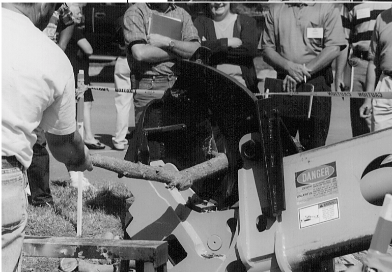
Slicing through a branch is a piece of cake.

BRUSH CONTROL on county roads can be a major challenge. Low hanging branches can interfere with motor grader and truck operations and act as a snow trap during the winter.