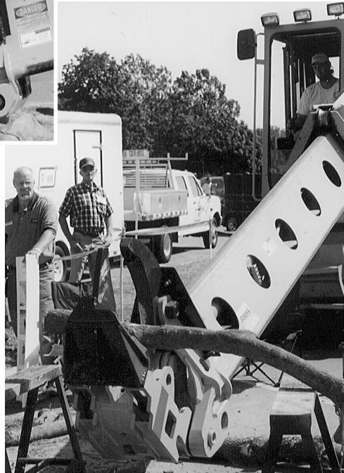
The limb lopper is mounted on a Gradall boom.